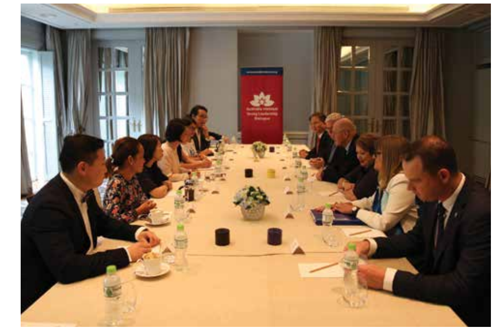
Discussions with Governor-General of Australia and AVYLD in Vietnam, 2018